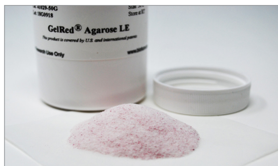
GelRed® Agarose LE