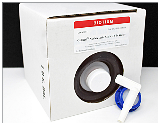
3X GelRed® in Water